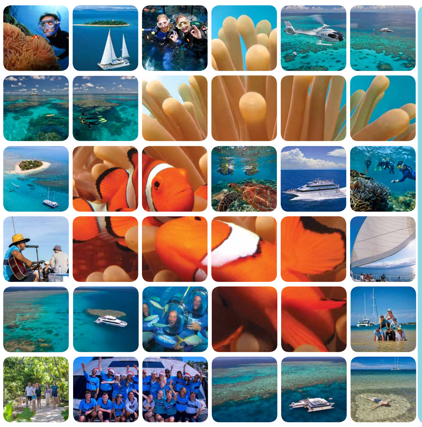
Experience Nature's Finest with Australia's Best